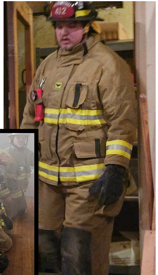
Here are a few photos from the FireFighter 1 course, including the Hazmat operations class.